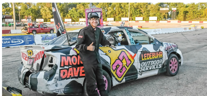
BEST APPEARING CAR CONTEST

HAVE FUN • RACE YOUR FRIENDS • IT'S A BLAST!