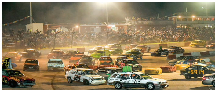
SIDE-BY-SIDE RACING ACTION