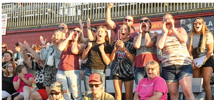
TEAM MUST PROVIDE LAP SCORER