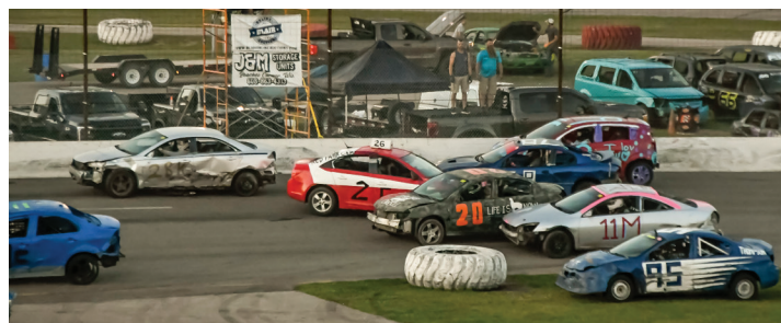
BONUS PRIZES AFTER THE RACE

$1200 TO WIN - TOP 20 PAY- $650 BONUS PAY!