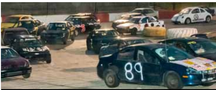
SIDE-BY-SIDE RACING ACTION