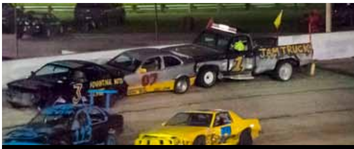
JAM TRUCK TO PUSH IDLE CARS AWAY