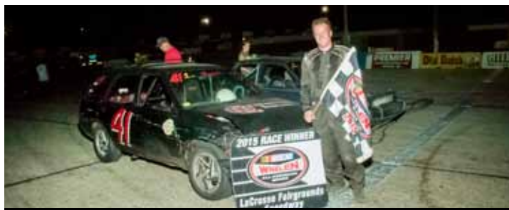
BONUS PRIZES AFTER THE RACE