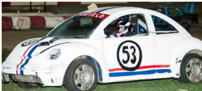
BEST APPEARING CAR CONTEST

HAVE FUN • RACE YOUR FRIENDS • IT'S A BLAST!